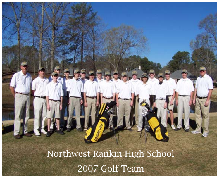
Northwest Rankin High School 2007 Golf Team