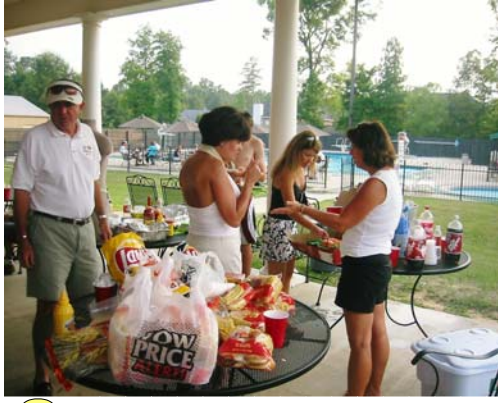
Folks gather around the “Good Stuff” - grilled hamburgers, hot dogs, Teri’s tator salad & cake.